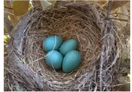
An American Robin's nest, a reminder that spring and summer are great birding seasons.