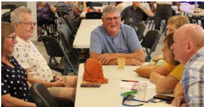
The pop-culture trivia contest was a fun reminder of TV shows and advertising slogans from the past.