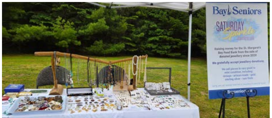
The Bay Seniors table at the June 13 Hubbards Farmers' Market. Saturday Sparkle will be back at the market on July 25, 8am-noon.

Saturday Sparkle volunteers look forward to being back at the Hubbards market on Saturday, July