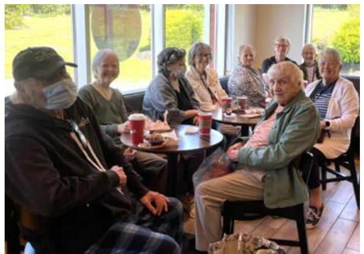
Grocery Shopping Program participants and volunteers relax together after their June 11 shopping trip.