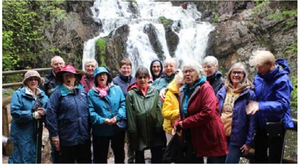
Our hardy excursionists said Victoria Park was still gorgeous, despite the rain.

Just as the bus pulled into the park, the skies opened and the rain began. Undeterred and armed with our rain gear, the whole group went