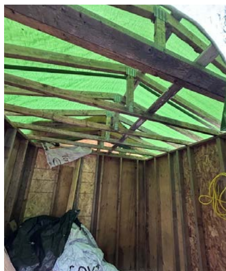
The shed interior before.