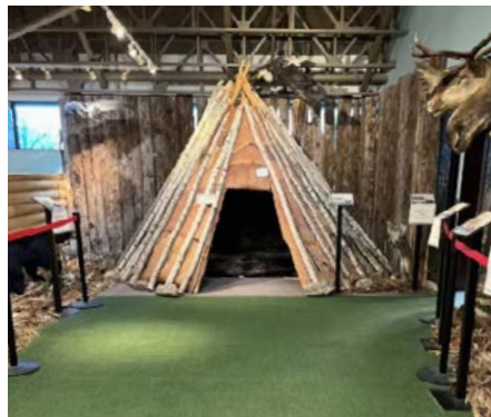
Part of the live-in village exhibit at the Millbrook Heritage Centre.

We will depart from Sonny's Road, behind the Community Enterprise Centre. Participants are asked to arrive by 8:45am for a 9am departure. Plan for any weather,