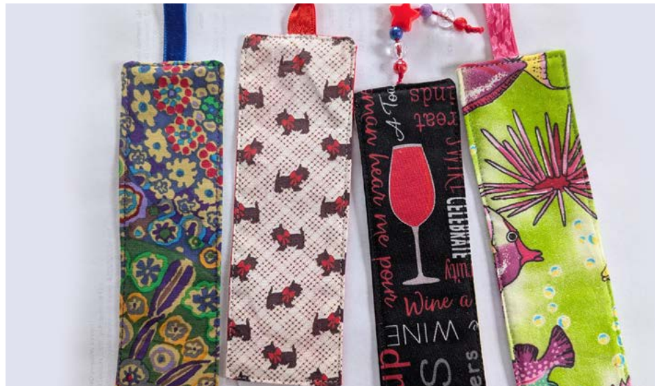
The Bay Seniors Sewing Group has a bookmark for any occasion.