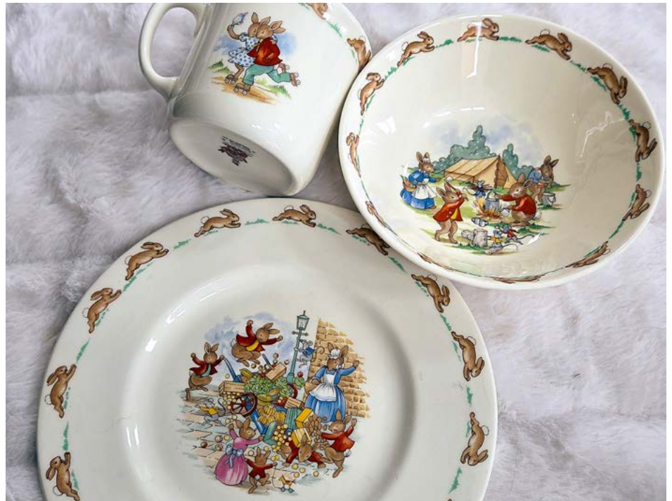
One of two Royal Doulton Bunnykins children's sets, in perfect condition. An example of how we've priced everything to sell, this set is valued at $100, and is on sale at the Giant Flea Market for just $10.

Come and check out tables overflowing with the practical, the whimsical, and the valuable—all priced to offer buyers terrific bargains. There is no admission