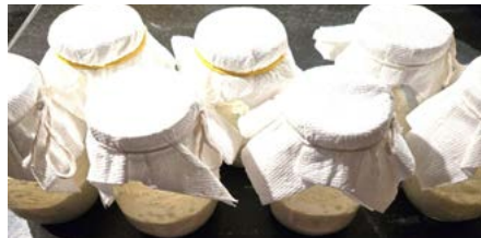
The Well Preserved home-canning interest group meets once a month through the winter. In January, sourdough starter was shared, so there can be bread to enjoy with jams and jellies made in the fall.

continue on their own, jamming to perform at local coffeehouses and future Bay Seniors' events on request.