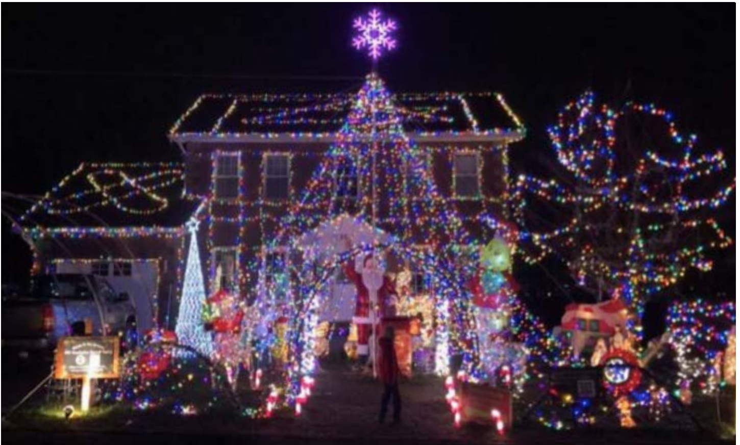
One of the houses in Fall River that delighted our excursion participants.