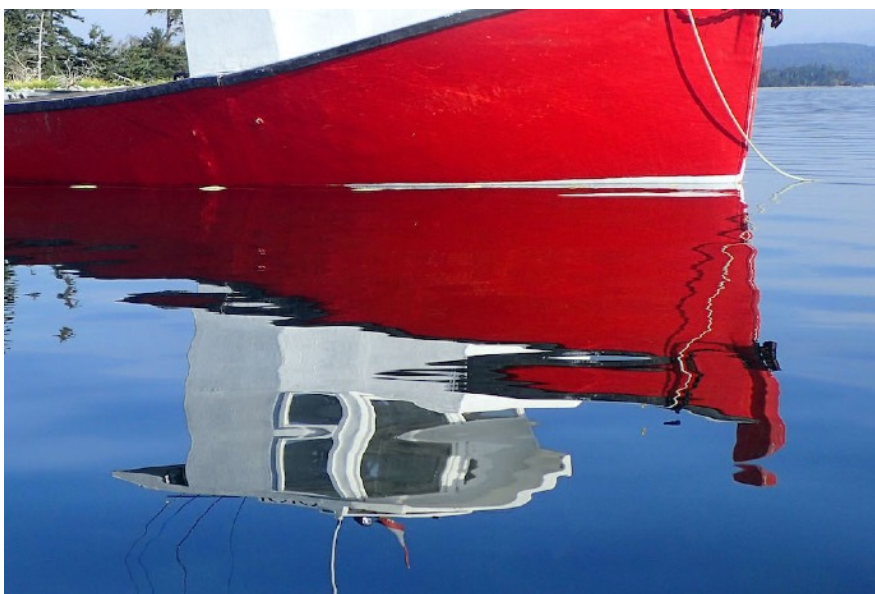
Red Lobster Boat - Beth Newman, photograph on canvas

More than 70 artists will show their works in over 40 locations around the region. See the tour guide online here https://halifaxartmap.com/art-map/pcafa or pick up a printed version from the Community Enterprise Centre, which is Stop One on the tour.