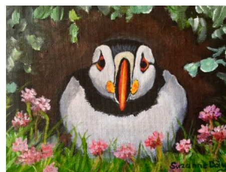
Peek-a-Boo Puffin - Suzanne Day, acrylic