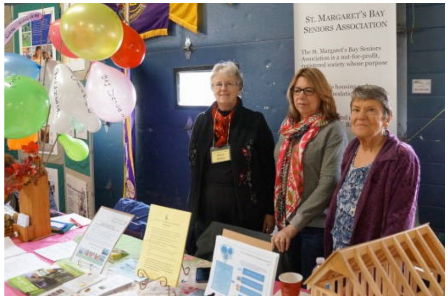
Some of our volunteers at Bay Expo. We have more Expo pictures in a special gallery on page 3.

We want to extend a heart felt "thank you" to the many volunteers who helped to make the 2017 Expo a success. There